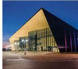
2017 KPHA Conference Sessions: Prevent, Promote, Protect